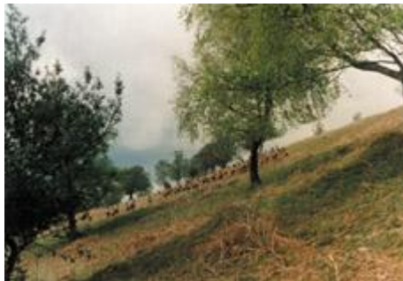
Red Deer hinds at Triscombe in summer